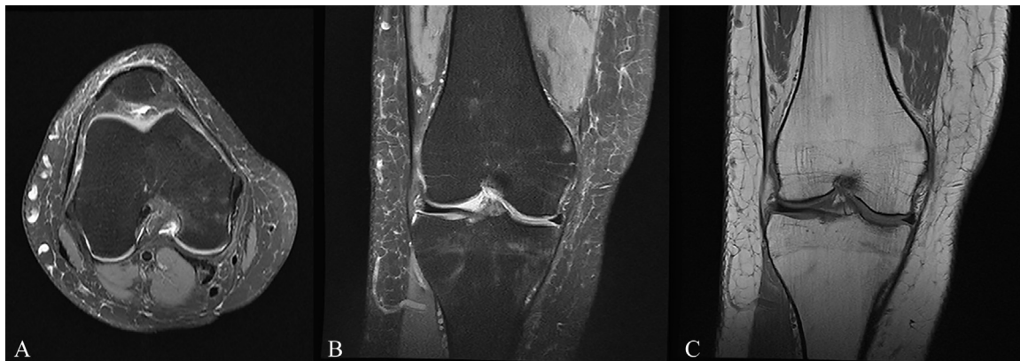
Fig. 3 – Follow-up MRI images (A) axial plane, PD fat-saturated sequences; (B) coronal plane, PD fat-saturated sequences; (C) coronal plane, T1W image.

Table 1. According to the analyzed literature, the median maternal age was 36 years (interquartile range (IQR), 36-39) with 71% of cases occurring during the first pregnancy. Three pregnancies were the result of in-vitro fertilization (IVF), and all pregnancies were uneventful. In all women onset of symptoms started in the third trimester of pregnancy and the diagnosis was confirmed using MRI. The most common symptoms were progressively worsening joint pain, tenderness, and limited ROM, with or without intraarticular effusion. Treatment was conservative (analgesics, calcitonin, calcium and vitamin D supplements, limited weight bearing, rest). The complete resolution of symptoms occurred after a median of 12 weeks (IQR 10-25) or 3 months. A supracondylar femoral fracture complicated one case. The data about delivery was available in 5 cases, and 4 newborns were term.