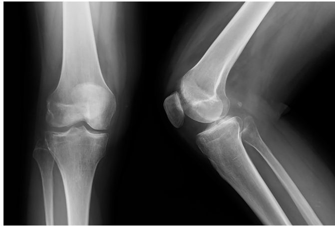
Fig. 1 – Plain radiographs of the knee with patchy bone demineralization of the lateral femoral condyle and tibia.