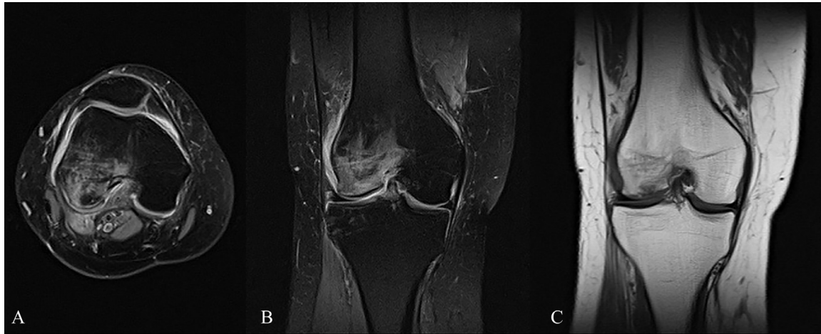
Fig. 2 – Initial MRI images (A) axial plane, PD fat-saturated sequences; (B) coronal plane, PD fat-saturated sequences; (C) coronal plane, T1W image.