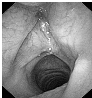
Fig. 2. Huge synechia of the anterior 2/3 of vocal folds.

Synechiae. Synechiae (Figure 2) are more common after type VI cordectomy (resection of the anterior commissure and the anterior thirds of vocal folds) 10 . Also, synechiae are frequent in cases of revision procedures, especially in the area of cricoid cartilage. They usually cause voice disturbance, much less difficulty with breathing. The treatment of choice is laser resection following local application of Mitomycin C or laser resection and keel placement, depending on the extent of the synechiae 11 .