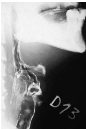
Fig. 3. Videofluoroscopy during barium swallow showing aspiration in a patient with endoscopic supraglottic laryngectomy of T2 tumor.

hemorrhage was documented in 13 (6.4 %) patients. In seven of these, it was necessary to perform a revision in the operating room, while one patient with supraglottic cancer died on postoperative day 9 due to massive late bleeding. Temporary aspiration occurred in 19 (26 %) patients with supraglottic cancer resection (Figure 3), six of them developing postoperative pneumonia. One patient suffered heavy aspiration and recurrent aspiration pneumonia, thus total laryngectomy was performed nine months after primary ELS. In patients treated for glottic carcinoma, close follow-up revealed granulomas in ten and synechiae in seven patients. Seven patients had more than one complication.