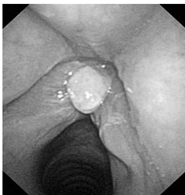
Fig. 1. Typical granuloma rising from the anterior commissure.

Granuloma. Granulomas (Figure 1) are non-cancerous growths composed mostly of granulation tissue and they reflect tissue response to injury and irritation. They frequently occur at 1–2 months after surgery, and it is not rare that they later disappear. It is important not to overlook the difference between granuloma and cancer recurrence. When endoscopic finding definitely indicates granuloma, no further treatment is necessary. However, if endoscopic finding is raising any suspicion, control laryngomicroscopy with biopsy and histologic analysis is necessary.